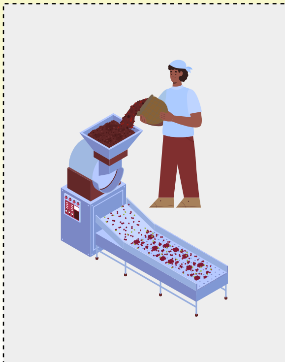
02 Exporters (dry mill processing)