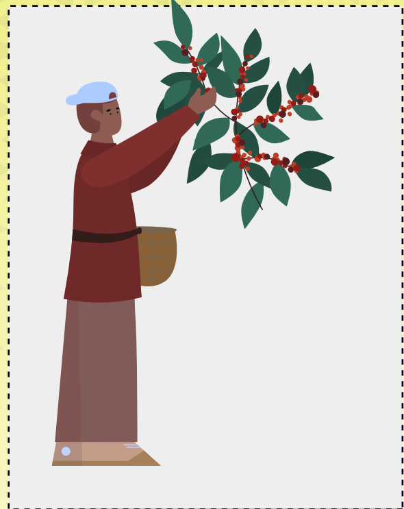
01 Farmers collect coffee

Kerchanshe has revolutionized the coffee industry in Ethiopia by opening the coffee processing plant in Bule Hora, the first plant outside Addis Ababa. The plant, which is currently operational, will be able to cut out all the middleman and allows the coffee farmers to sell the crop directly to the dry mill.